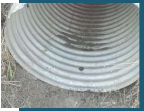
West ALT2 Water Side